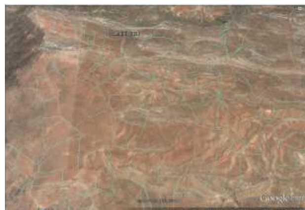
FIGURE 9. The supposed mulla that live in the vicinity of Di-Bên

Figures illustrating articles on pages 17-18