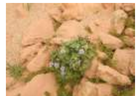
The regeneration plot in Momi on 8 July 19 species of plants have returned to the site, some endemic or threatened species. The plot was quite green in comparison to surrounding areas.