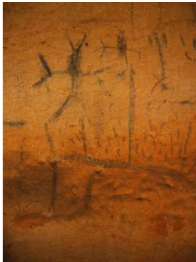
FIGURE 4. A close-up image of an antlered person or a cross fourchee; note the large three-masted vessel with the lines extending from the deck.