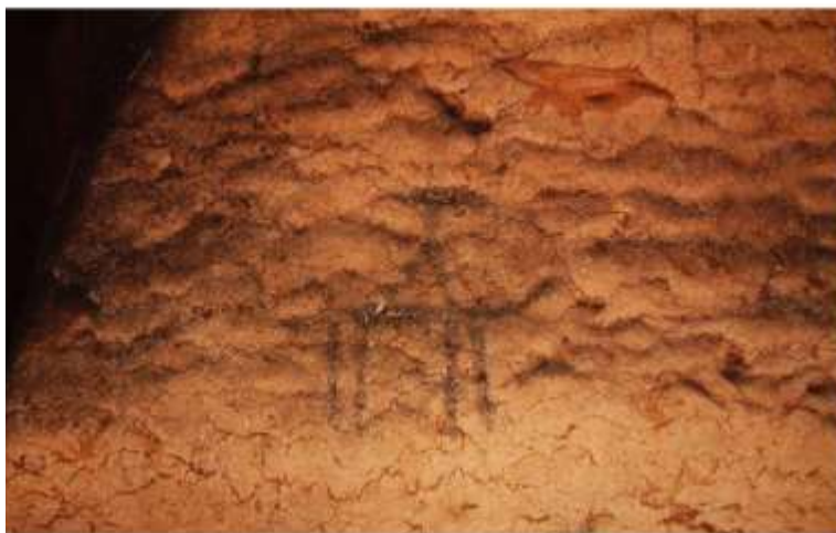
FIGURE 7. A close-up of the Arabian camel and rider.