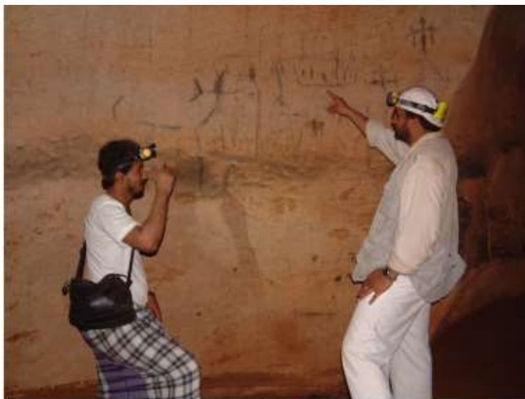
FIGURE 2. The southern panel showing the geometric patterns, vessels, and crosses