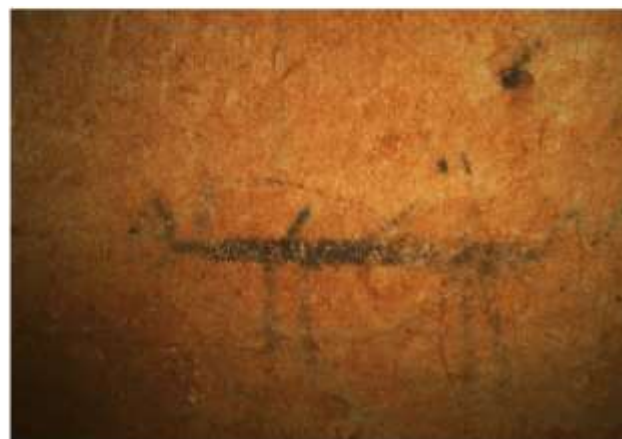
FIGURE 3. An abstract image of a possible animal or insect.