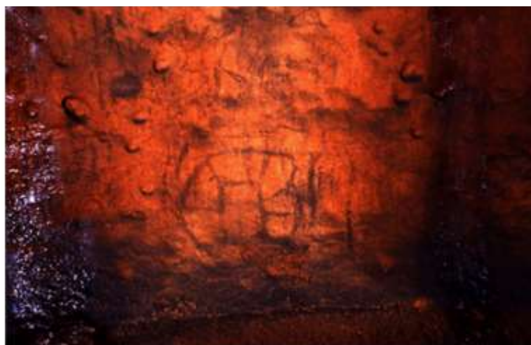
FIGURE 10. The circular drawing representative of a central 'farmstead' with outlying boundary walls.

Figures illustrating articles on pages 17-18