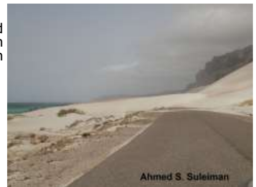
Photo 3. Erher and newly formed lagoon, photo towards north

Photo 2. Erher and newly formed lagoon, photo towards south